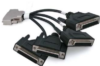
4-port DB25 Octopus Cable Included.