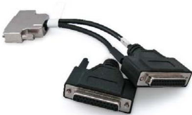
Dual Serial DB25 Octopus Cable Included.